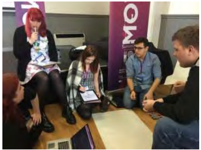
Students at work on The Creative Challenge

I enjoy being part of Emerging Talent Day. The room seemed to throb with energy, crowded with young people eager to soak up knowledge. My contribution to the day was my talk on How to Pitch Your Animation Idea . It was exactly what the title suggested. Beginning with how to structure your presentation, I stressed the importance of visuals such as a storyboard, puppet, etc. I also gave basic common sense tips that beginners often seem to forget such as don't turn your back on the audience and talk when you put a visual on the screen.