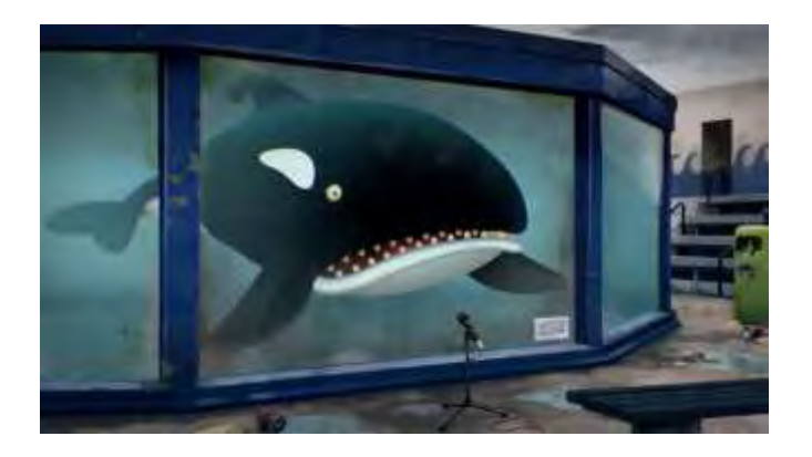
AARDMAN HAS CREATED AN IMPRESSIVE PSA BASED ON 'CREATURE COMFORTS' Creature Discomforts: Life in Lockdown https://www.bornfree.org.uk/

PETER JACKSON'S WETA LAUNCHES AN STUDIO Weta ANIMATION Digital in Wellington, New Zealand has won six visual effects Academy Awards, ten Academy Sci-Tech Awards and six visual effects BAFTA Awards. Notable and upcoming projects include Avaengers: Infinity Wars, Avengers: End Game, Game of Thrones, Space Force, Mulan and Black Widow. Director Peter Jackson and producer Fran Walsh's credits also include King Kong (2005 version), Avatar, Lord of the Rings and The Hobbit series of features (plus lots of other special effects features). They are expanding to create an animation studio, but they have not yet disclosed details about their proposed projects.