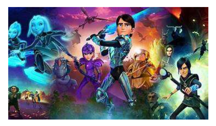
GUILLERMO DEL TORO'S 'TROLLHUNTERS: RISE OF THE TITANS,' Made with DreamWorks,it premieres July 21 on Netflix. See an action packed trailer:

https://variety.com/2021/film/news/trollhuntersguillermo-del-toro-dreamworks-netflix-1234996497/ READ 'VARIETY'S' ARTICLE ON THE WINNERS OF ANNECY 2021