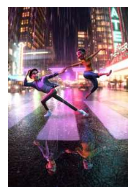
'US AGAIN' IS DISNEY ANIMATION'S NEW MUSICAL DANCE SHORT The elderly stars discover

classic?utm_term=342973347ab88fd52c7bffa0bfb4da 20&utm_campaign=GuardianTodayUS&utm_source =esp&utm_medium=Email&CMP=GTUS_email