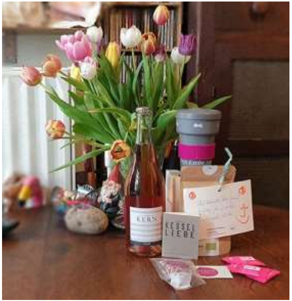
My Press Brunch

This year my Press Brunch arrived at my door in a box via my postman. When I opened the parcel I discovered a selection of delicious regional delicacies! There was a packet of granola from Die Muesli Manufaktur in Hohenstein, delicious candies courtesy of Sweets in Stuttgart, a large bottle of sparkling grape