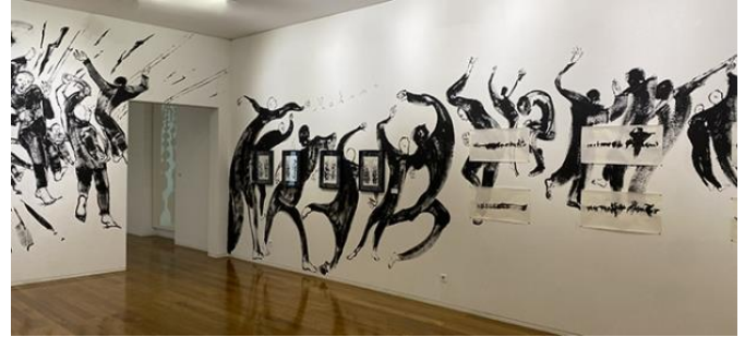
Raimund Krumme's spontaneous paintings

paintings on the museum's gallery walls. The exhibit was only up during the festival and the spontaneous paintings only existed during the exhibition.