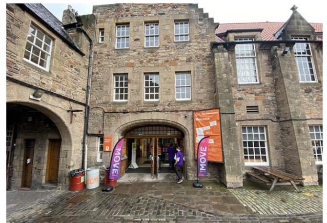
The Pleasance Compound

After a two-year hiatus due to Covid, it felt great to be back in Edinburgh for the MOVE Summit. The three-day event brings together not just the Scottish animation industry but people from all over the world to give presentations and workshops. There were as many as four separate rooms full to capacity at times with workshops and presentations in the Pleasance Compound. This historic compound is also one of the main venues of the Edinburgh Fringe Festival and derives its name from the Scottish word pleasance, meaning a park or garden.