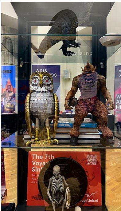
The Ray and Diane Harryhausen Foundation exhibition

Along with all of the talks and presentations, there was also an exhibition area. It was an opportunity for studios to show off their work and talk about what they are looking for in potential new employees. I was particularly interested to learn about the National Library of Scotland's Moving Image Archive. With over 3,000 clips and full-length films ranging from home movies, documentaries, and industry to entertainment films, the National Library preserves and promotes access to films capturing Scotland and her people from the early days of filmmaking to the present. Some of their collection is available online.