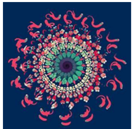
The chili pepper Mandela was this year's trailer