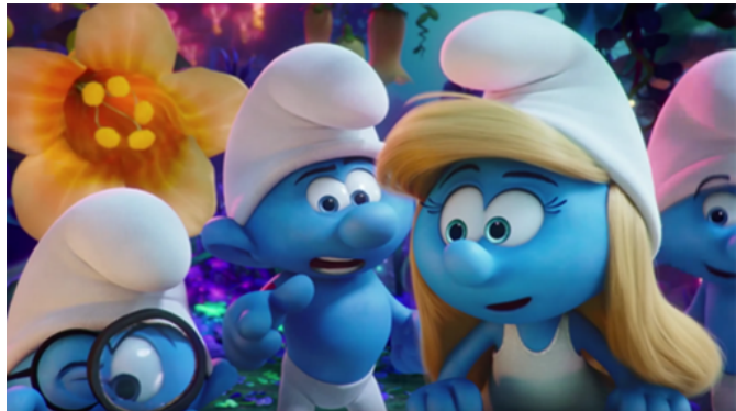
SMURFS: THE LOST VILLAGE'OPENS IN APRIL The Hollywood Reporter sums up Smurfs: The Lost Village from Sony in four words, "Geared only for young viewers." Yahoo News says, "Anyone who would go to this movie without children is seriously starved for entertainment."