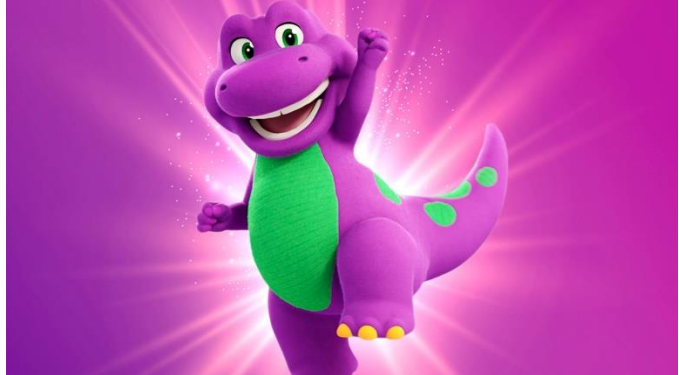
BARNEY IS COMING BACK IN 2024 AS AN ANIMATED SHOW Mattel is relaunching the franchise built around the purple dinosaur. The program will feature a preschool animated series. Barney will no longer be portrayed by a human in a T. Rex costume. Of course the best part is there will be wonderful consumer products available.

Later pre-code gems find Bimbo and Koko as secondary characters and Betty is the star. Among those greats are Minnie the Moocher , 1932; Betty as Snow White , 1933; Is My Palm Read , 1933 and Chess Nuts , 1933.