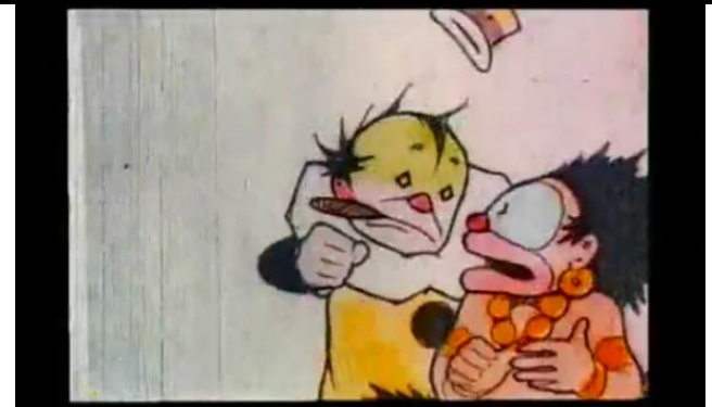
SEE WORKS BY ANIMATION PIONEERS IN STATE OF THE ART FLIPBOOKS There are 6 clips in each book. See a different clip if you flip the edge from the left, right or central part of it. Then turn the book over and see three more. See clips by Winsor McCay, Lotte Reiniger and others in action at https://flipboku.com/collections/the-pioneerscollection