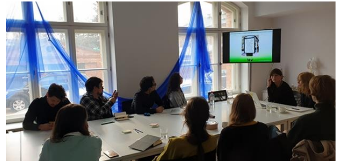
Green Filming round table

There were also several panel discussions on topics ranging from Green Filming in Stop Motion to a Women in Animation round table.