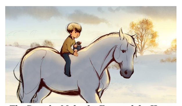
The Boy, the Mole, the Fox, and the Horse THE RACE FOR THE OSCAR FOR BEST ANIMATED SHORT This year all five animated shorts are by independent animators. They range from lovely sweet family shorts to an adult film about a teenage girl with sex on her mind. There is also a fascinating experimental student film and two others worthy of the award. I'm not sure how the vote will go. The voting is between March 2 and 7, 2023, and the 95th Oscar telecast will be on Sunday, March 12. It will be on ABC at 8:00 p.m. ET/ 5 p.m. PT.

The Boy, the Mole, the Fox and the Horse by British illustrator Charlie Mackesy is a lovely hand-drawn fable about the virtues of kindness. It is based in his bestselling picture book for kids and is a wonderful, charming story worthy of an Oscar. https://www.youtube.com/watch?v=AjK3NIXRoVU.