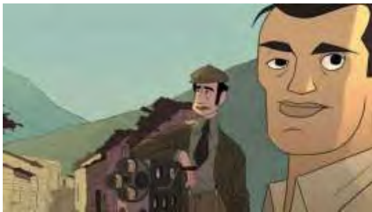
Bunuel in the Labyrinth of Turtles

UBISOFT, THE FRENCH VIDEO GAME GIANT, IS PLANNING ANIMATED ADAPTATIONS OF THEIR HIT GAMES FOR TV The French company's Rabbids Invasion is now in its 4 th season series on Netflix so they have decided to mine their games library for more family friendly offerings. Up next is Hungry Shark Squad , based on the mobile game Hungry Shark . Ubisoft is also toning down its M-rated Watch Dogs action-adventure franchise for a tamer "cyber mystery" aimed at tweens. The show centers on a teenaged super hacker who solves crimes in her high school. They also are developing a young-adult series Captain Laserhawk: A Blood Dragon Vibe based on their M-rated Far Cry 3 expansion of Blood Dragon and an animated sketch comedy about the video game culture.