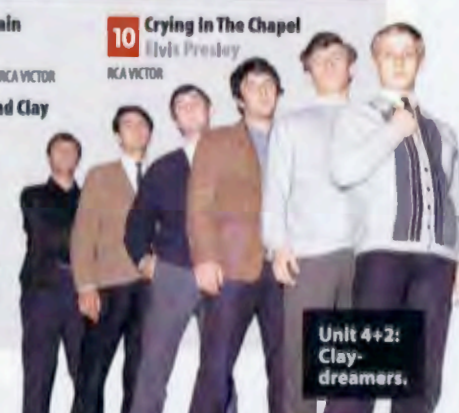
Unit 4+2: Clay-dreamers.