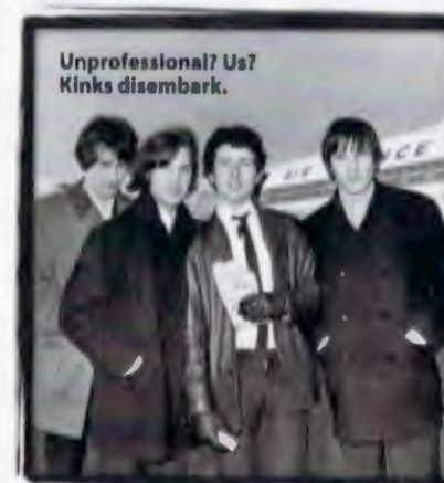
Unprofessional? Us? Kinks disembark.

JUNE 7 At a screening of Elvis Presley's Harum Scarum, even his manager, Colonel Tom Parker, is alarmed by the film's lack of coherence. He declares it would take "a fifty-fifth cousin to P.T. Barnum" to sell such a waste of celluloid and even suggests slotting in a talking camel to make the film seem more deliberately nutty than it already is. The action, set against some of Hollywood's most unconvincing back-lot scenery, involves a singing star on tour in the Middle East who gets involved in a plot to assassinate the country's ruler. Elvis always was a man ahead of his time.